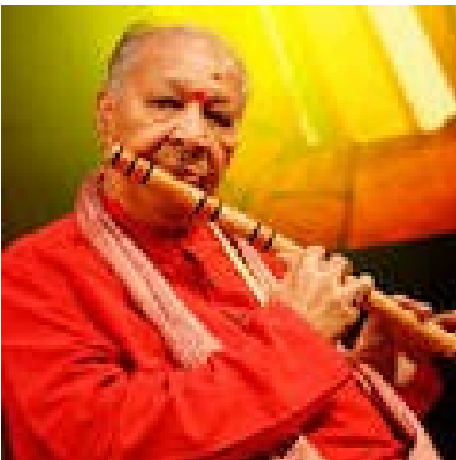
Hariprasad Chaurasia -