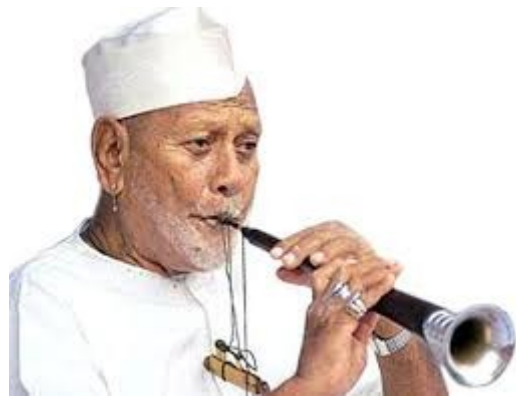
Bismillah Khan - .....