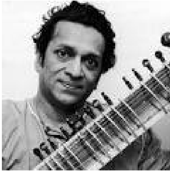
Ravi Shankar - .....